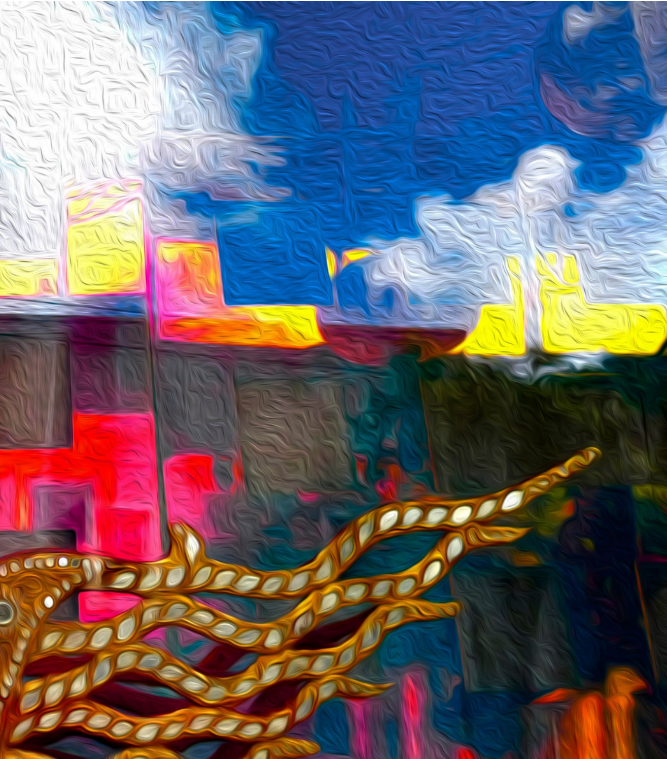
filmore street, san francisco ca